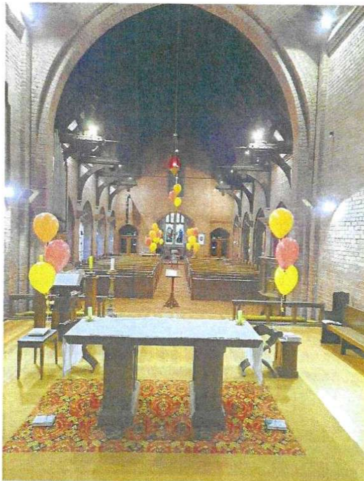
All Saints Preston – Pentecost Sunday 2024